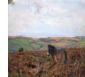
P_{0.5}(w, f) \rightarrow Q_{12}(w, f)