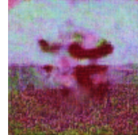
P_{0.5}(w) \rightarrow Q_8(w, f)